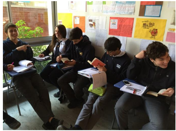
Pictured: 10 th grade students read The Curious Incident of the Dog in the Night-time, a novel in English.

Students in the III Unit were asked to reflect on some of the great qualities, memories, and lessons learned at Saint George's College.