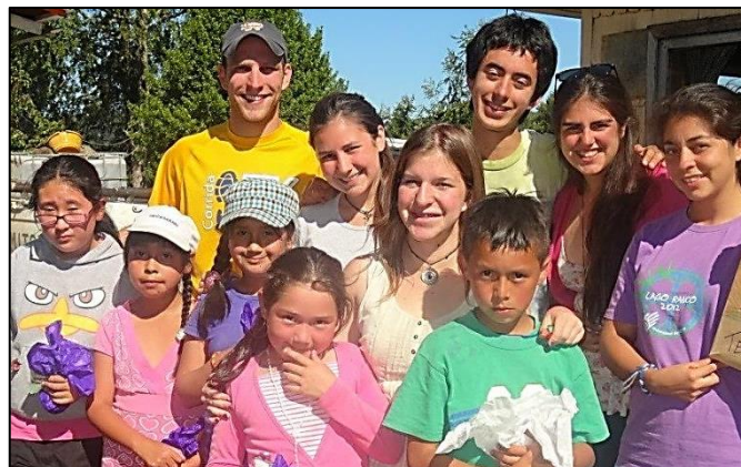
Photo of a group from last year's Misiones trip to Quillacahuín.

If I would have to rate this experience, I would have to say that it was one of the most incredible experiences that I have ever had. The humility of the people there is gorgeous. They are away from everything, but it is not a difficulty for them, they are happy with what they have. During the year