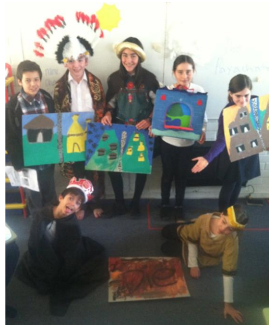
Students from 5A Drama English Club

We are so proud of our students and all they do in English. Read more in the following pages, and be sure to come celebrate with us on August 19 th !